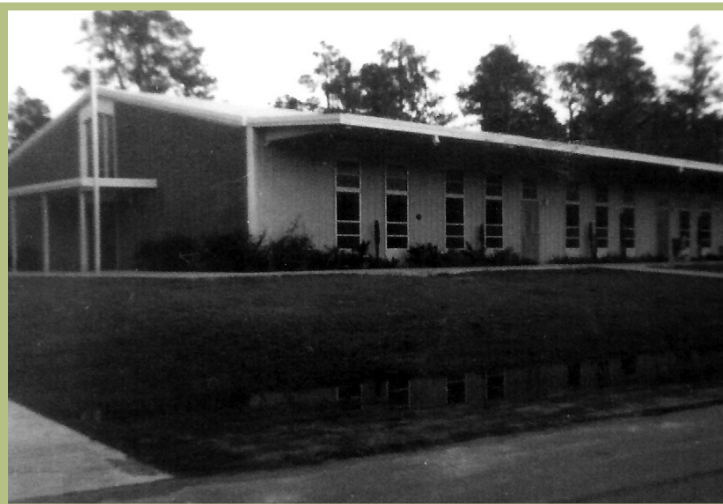
Original Nativity building built in 1962.

Meanwhile, the men were also busy. A barbecue pit had been built on church grounds. Monthly, the men barbecued, the ladies provided covered dishes, and the people came, not only just parishioners, but from the surrounding area.